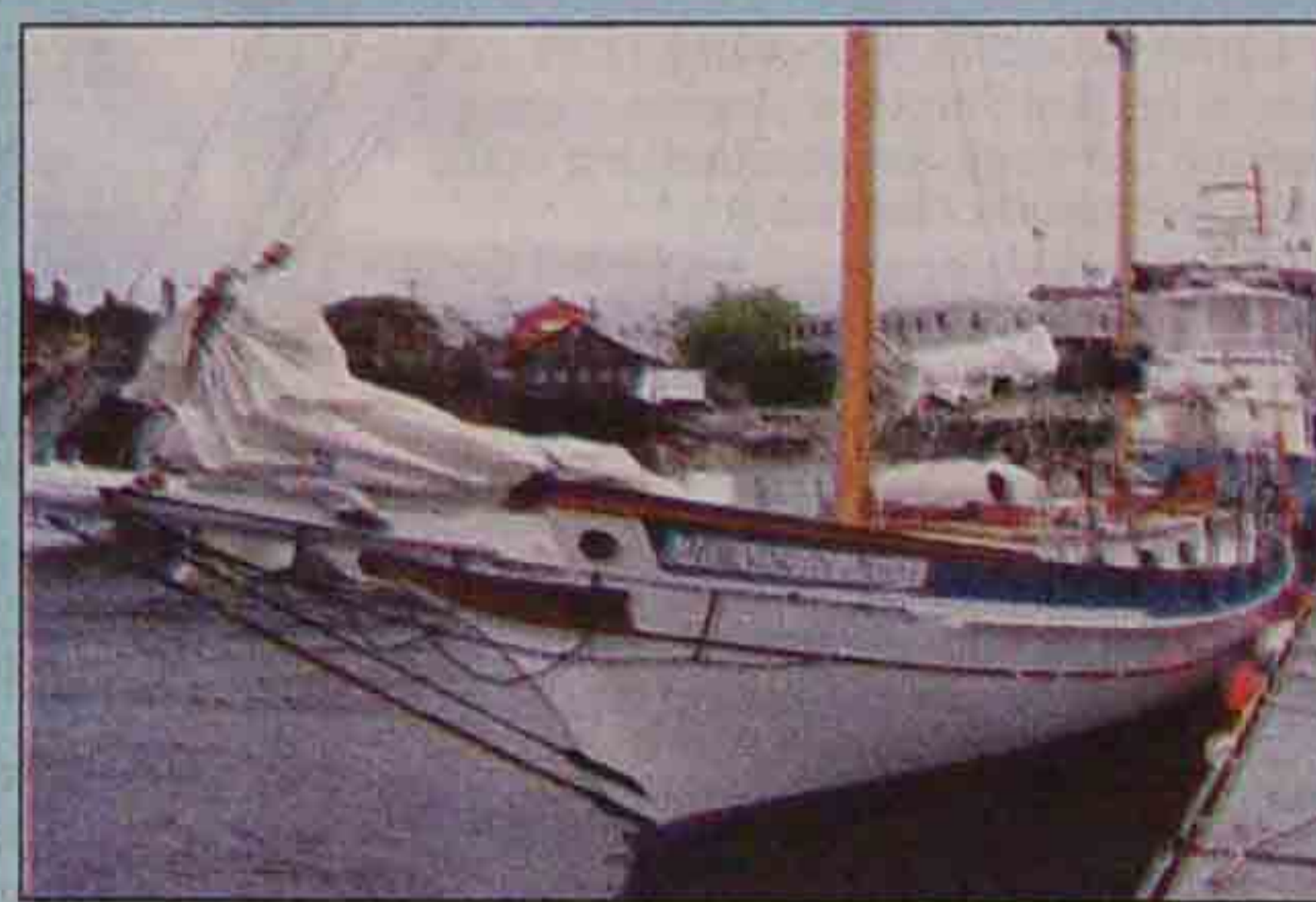
The 55-foot ketch, 'Morning In Maine,' docked in Rockland, Maine.

For another and completely different adventure you must cross the dock and board Captain Jack's boat for a lobster cruise. Now Captain Jack is really Steve Hale. The