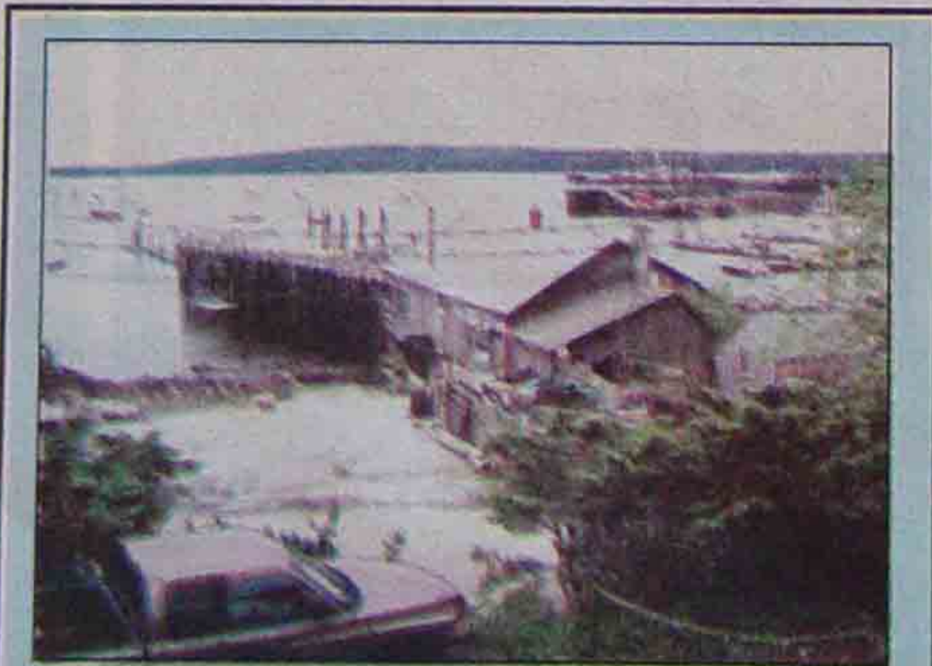
Rustic and American - that's Maine.

Until next time, be sure to keep up with our stories at www.travelstorymagazine.com or email me at VGArnette3@aol.com .