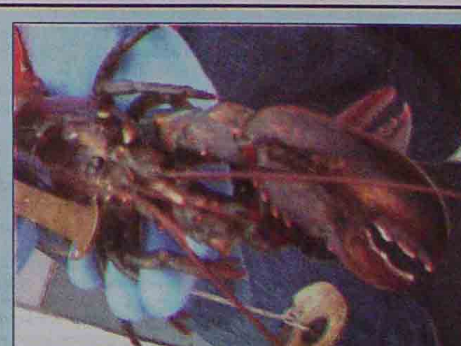
The star of Maine!