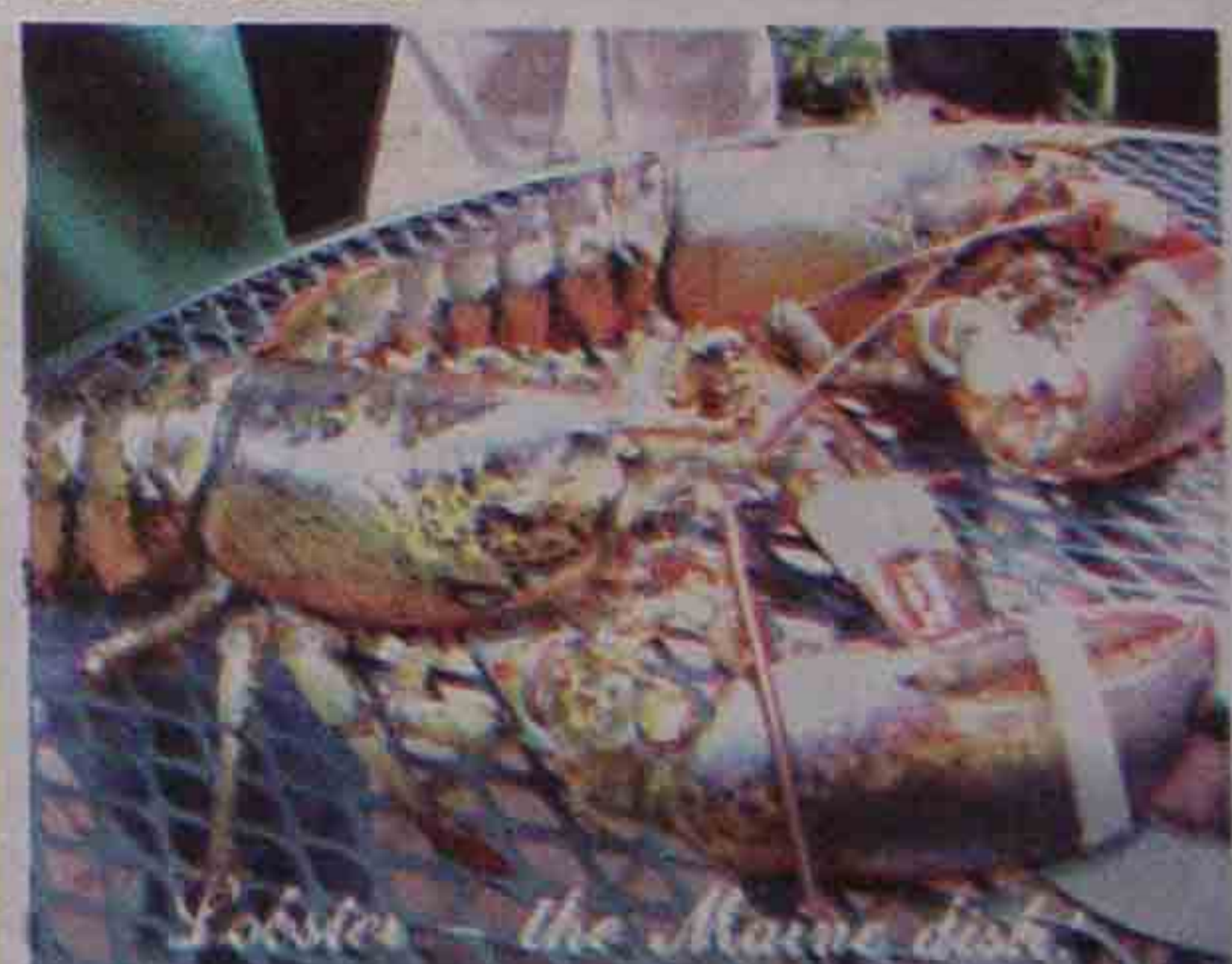
Lobster - the Maine dish.