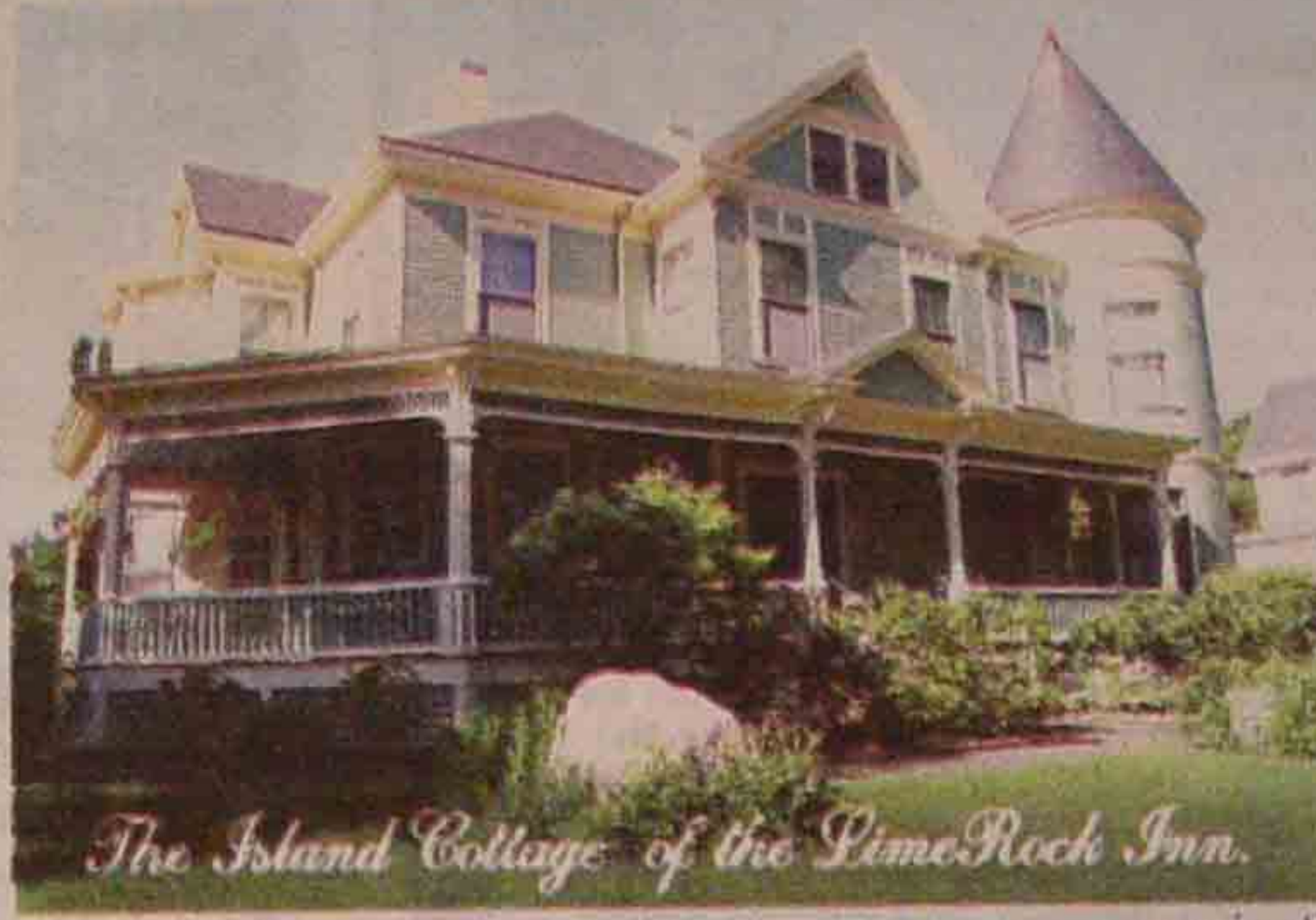
The Island Cottage of the LimeRock Inn.

also offer TV upon request. You can dine in the Inn's spacious and sunny dining room to enjoy delicious and creative breakfasts. This is a non smoking Inn and pets are not allowed. There is so much more so contact them for a brochure. info@lime-rockinn.com. Now it has been named among the top 25 best undiscovered inns for romance, and what a romance it can be. Listed on the National Historic Registry, the LimeRock Inn is a beautiful