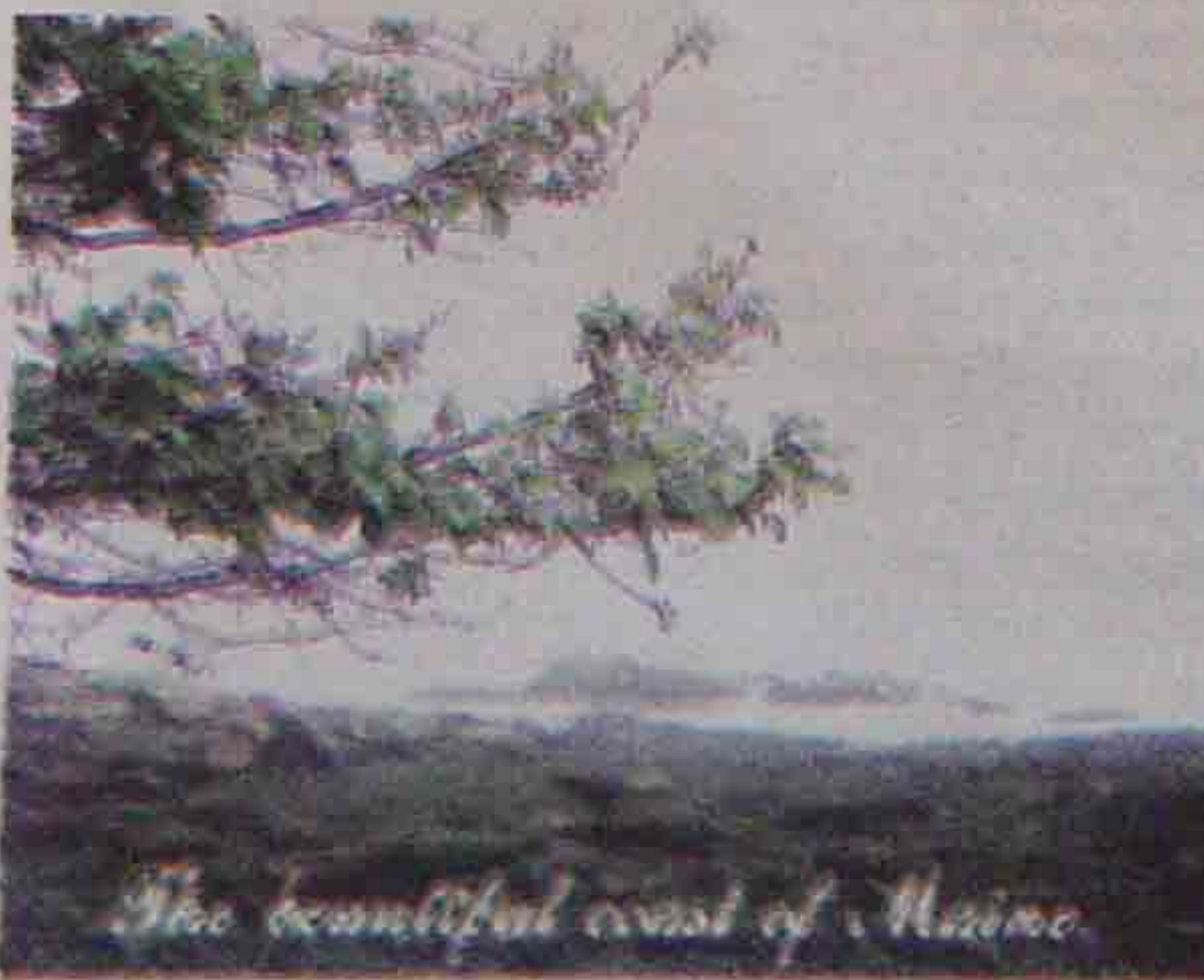
The beautiful coast of Maine.

To keep up with all of the travel stories visit our award winning website at www.travelstorymagazine.com or contact me with your travel thoughts and ideas at VGArnette3@aol.com. Until next time, travel safe and enjoy the good old USA!